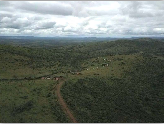
View back towards MPGR along main road